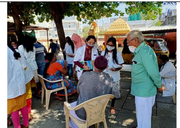
Sai baba Temple