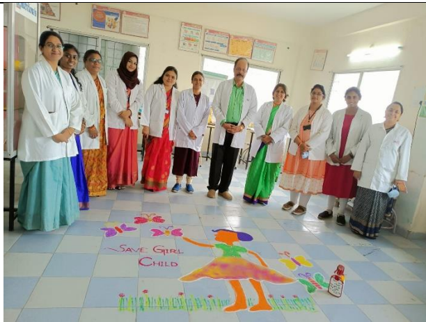
National Girl Child Day