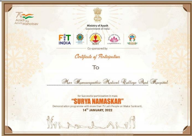
Suryanamaskar National Campaign