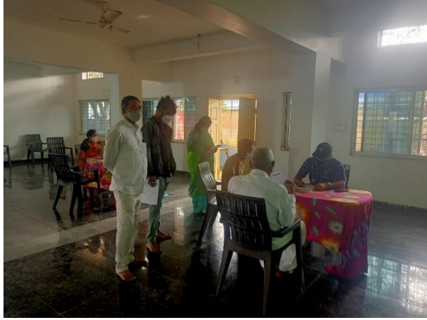
Sathya Sai baba Temple