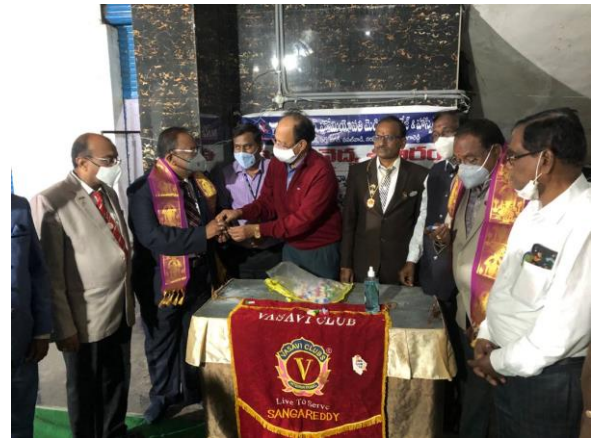
Distribution of Homoeoprophylaxis