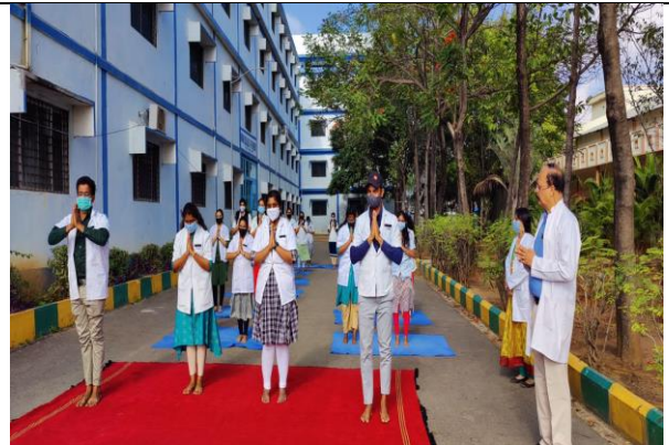
Suryanamaskar National Campaign