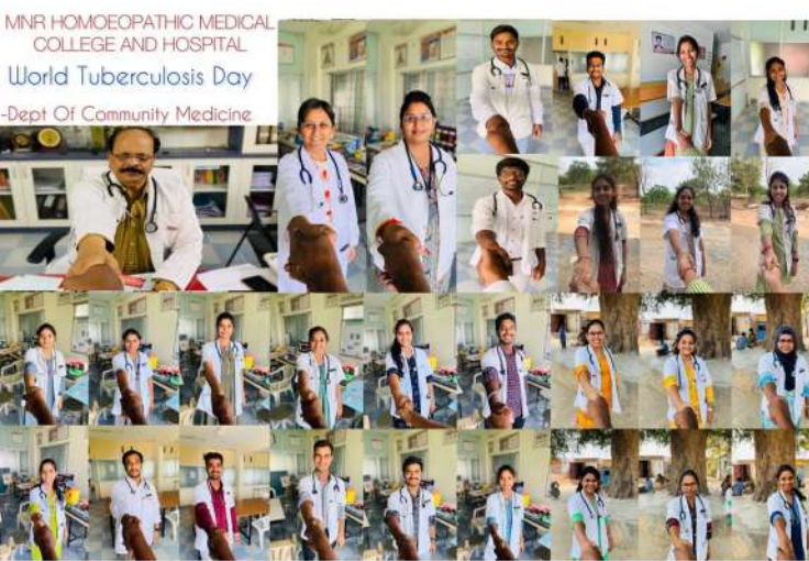
MNR HOMOEOPATHIC MEDICAL COLLEGE AND HOSPITAL World Tuberculosis Day -Dept Of Community Medicine